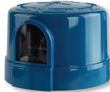
ZTL124-510J-LED Zero-Cross Electronic LED Photocontrol Mounting Turn-Lock